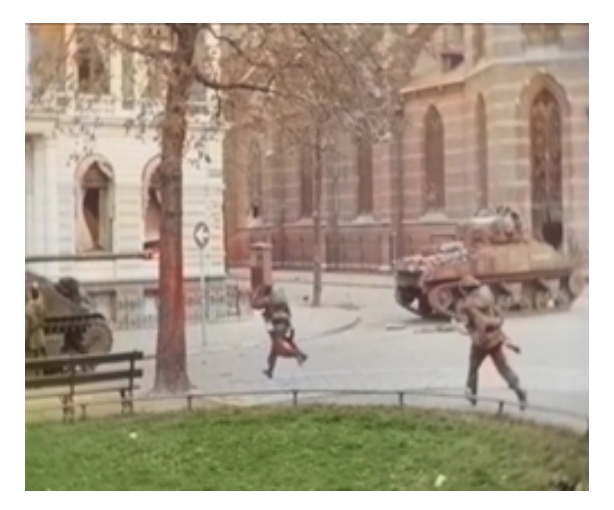
FIGURE 3: SCREENSHOT OF THE COLORIZED VIDEO "BEVRIJDING STAD GRONINGEN "

One of the colorized videos -after being shared on a social media platform- received over 61,000 views, 1,700 likes and was shared 521 times, illustrating the potential to engage new audiences.