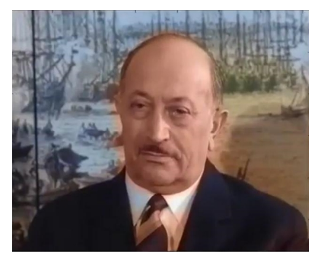
FIGURE 4:SCREENSHOT OF THE COLORIZED VIDEO "ACTIE VOOR WIESENTHAL"