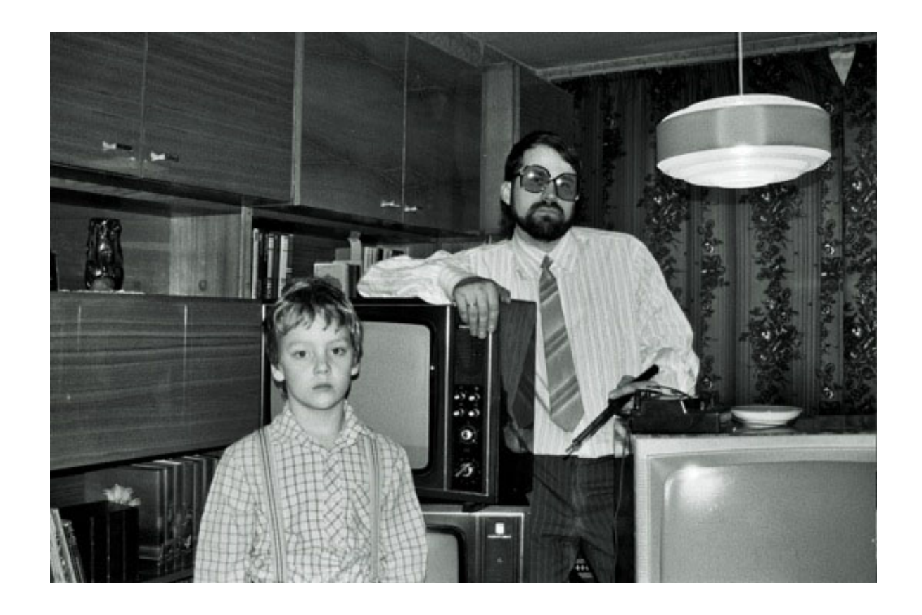
Fig.1 Disco and Atomic War documentary investigates the role of the Western popular culture that came through Finnish TV in Estonia in the 1970s and 1980s.