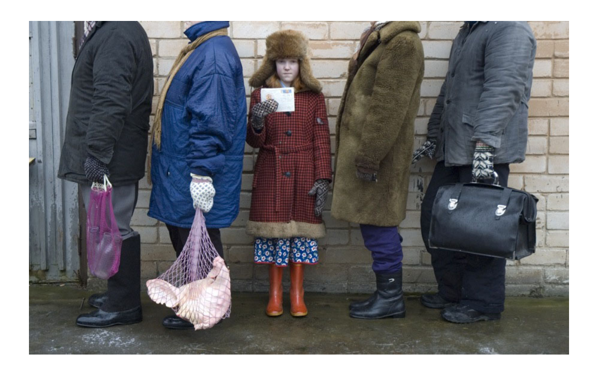
Fig. 3 A still photo from Disco and Atomic War.

Estonians were introduced to consumerism through Finnish television. Female viewers talked about how a strong desire for fashionable clothes, interior decoration, hairstyles and make-up was fuelled by Dallas and other American prime-time shows. Not surprisingly, commercials were some of the most frequently recalled content from Finnish television. People remember singing the tunes of Finnish commercials and dreaming of the advertised products.