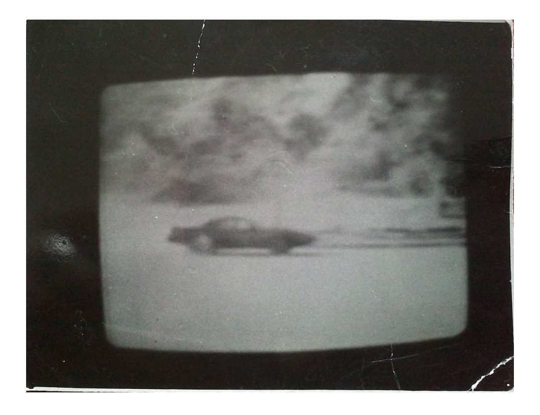
Fig. 2 The super car K.I.T.T. from Knightrider.

Clearly, one of the key words mentioned in the viewers' recollections was 'advantage': the participants saw themselves as superior – in terms of political awareness - to the Estonians who were unable to watch Finnish television. Those who were not able to watch Finnish television were easily labelled as uneducated 'hillbillies'. This feeling, common among the young participants, was not shared by the older generation who was born at the time of Estonia's first period of independence (1918-1940). These respondents did not feel that Finnish television was a political educator to the same extent that the younger generation did.