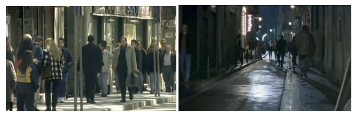
Fig. 6-7. Pepe Carvalho walks the (sometimes) sordid streets of Barcelona<sup>29</sup>.

Grasso's entire review is based on a comparison between the values of Vázquez Montalbán's text and the various deficiencies of the adaptation. In his words: