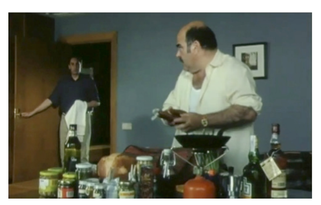
Fig. 9. Biscuter can't hide the tasty contents of his suitcase<sup>36</sup>.

Pepe Carvalho swims counter current and paradoxically it is Biscuter who intervenes in this modern world. When going to Paris, Biscuter finds the choucroute inedible and takes with him 'jamon Serrano', while wearing a Pulp Fiction cap. In another instance, the French racist cop played by Maurice Benichou addresses Pepe by talking to him about his 'Mediterranean arrogance' 35.