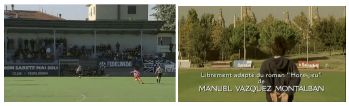
Fig. 4-5. The episode starts with a football practice in Barcelona, but soon moves to Perugia for the actual matches<sup>25</sup>.

changed the location of the pre-Olympic Games from Barcelona to Perugia<sup>24</sup>. The plot of the episode engaged with topics such as football and real estate and other topics that speak to television viewers across Europe, such as: drugs, father-son relationships, the philosophy of the "loser", or the pride that comes with being part of a small town.