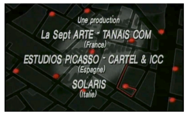
Fig. 1. In the opening credits, the producing companies are listed acknowledging their nationalities<sup>19</sup>.

It was Spanish, French and Italian producers together that initiated the idea of a television co-production based on the adventures of detective Carvalho. The production process for Pepe Carvalho was not unusual: the production company Cartel (at the time, one of the biggest in the Spanish media industry), in collaboration with the Institut de Cinema Catalá (Catalan Film Institute - a public institution), reached an agreement with Tele 5, the Spanish television channel (owned by the Italian company Fininvest), to develop an adaptation of some of the detective stories written by Manuel Vázquez Montalbán. Several partners were added to the initial Spanish production core which, according to official information, contributed to 40% of the production costs. One partner was Italian (Solaris Cinematografica) and the other one was French (Tanaïs Productions), each of them contributing 30% of the budget<sup>18</sup>.