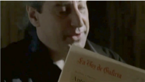
Fig. 10-11. Pepe Carvalho and some regional cultural elements shown during the second season of the series<sup>43</sup>.

These second series were broadcast only on regional channels in Spain and were never released on DVD. It is now a piece of invisible television, and even ARTE, which produced it and broadcast it, doesn't include any reference to this second season on its webpage devoted to Pepe Carvalho . This is a perfect example of the fate reserved for most of the television fiction produced by the regional channels in Spain. These productions, with a few exceptions (e.g. the Catalan-Andalusian miniseries about inmigration La Mari broadcast by TV3-Canal Sur in 2003), get marginal ratings and receive little media coverage, even when they feature famous actors. After a single broadcast, such series are destined to oblivion.