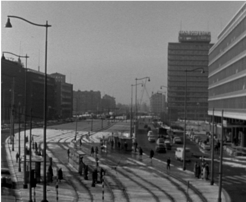
Still 11. Stad zonder hart (1966).