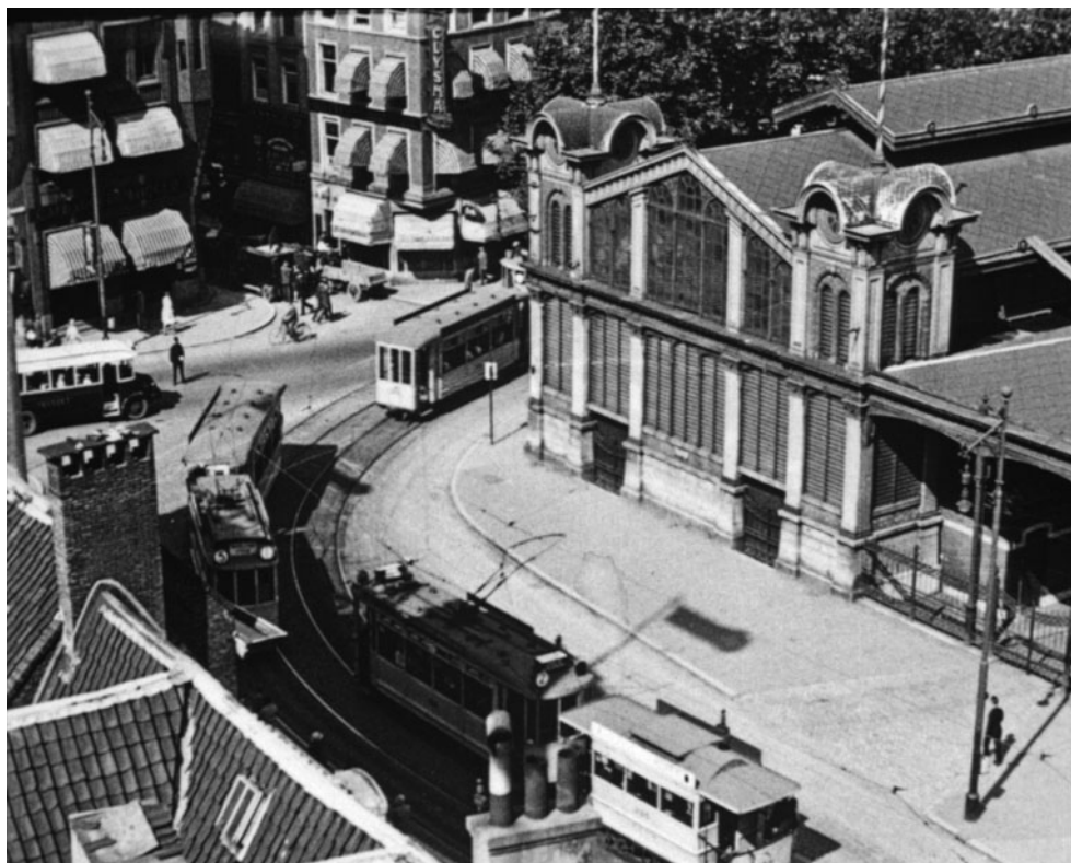
Still 2. From The City That Never Rests (1928), in En toch... Rotterdam (1950).

small-scale, pre-modern features as particular qualities. 42 This created an ambiguous image. However, because of its promotional purpose, only the images of the port and industry were kept in the recut versions that soon came to replace the original version. By 1938, all of it had lost promotional value, due to rapid changes in the port, and the material was handed over to the Rijks Historisch Filmarchief in The Hague. 43 After the war, especially the city images especially had gained historical value, and they were retrieved from the national archive. The city, as a system, recollected its own memory, thereby activating its own cinematic cognition, and by doing so, it created a distinction between itself and the state, on which it had depended in previous years.