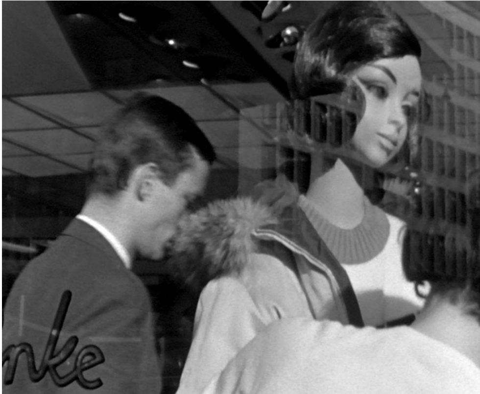
Still 14. Stad zonder hart (1966).

Rotterdam also suggests that, even though films may bend to either memory or oscillation, the functions remain intertwined. Memory also enables oscillation: found footage allows for juxtaposition of images, moving between perspectives, while it can also be used in different ways, from which new narrative lines are drawn. Oscillation in turn, creating perspectives for the future, also implies a new understanding of the past. This dynamic relationship between these cognitive functions fulfilled by moving images, is a characteristic of the city as an adaptive system . This is a modification of Luhmann's view, yet it also strengthens his claim that through these functions the notion of time itself is constructed.