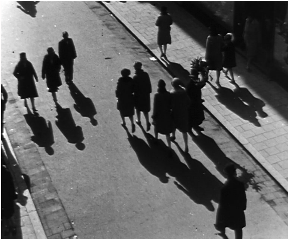
Still 3. From Hoogstraat (1929), in En toch... Rotterdam (1950).

Von Bary's work was retrieved, and reused—merely as traces of the old city, first of all by Piet Meerburg in his lyrical found footage film Rotterdamse Mijmeringen (see the next section). 45 En toch... reacted to it, using the same images as well as additional footage from amateur films and newsreels. The narrator of En toch... says that Rotterdam had been a lively city indeed, but it was not beautiful, and just dedicated to labour; moreover, it no longer met modern demands.