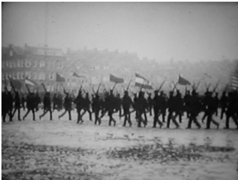
Still 8. From 250-jarig bestaan Korps Mariniers (1925, Orion), in Rotterdamse Mijmeringen (1948/1953).