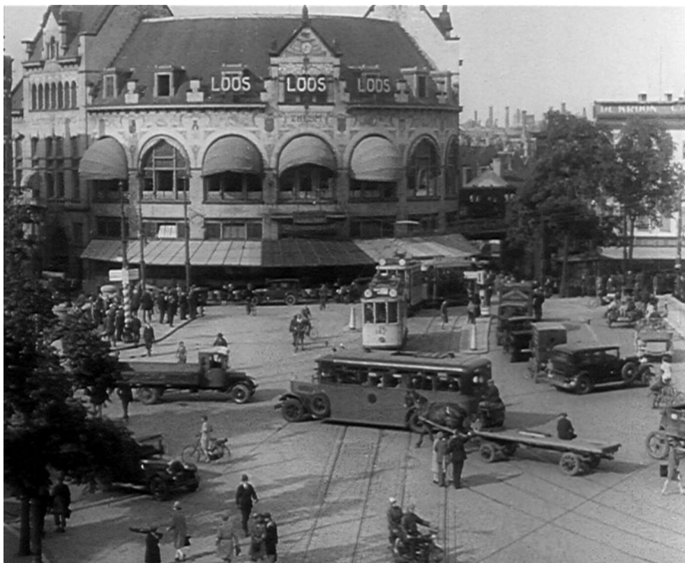
Still 1. From Hofplein (1932), in En toch... Rotterdam (1950). 41