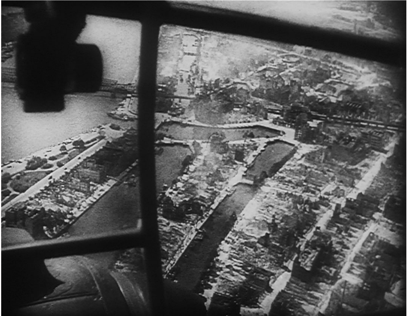
Still 4. From Angriff auf Rotterdam (1940), in En toch... Rotterdam (1950).

fact that these recordings were made before the establishment of the Office for Information and Publicity, which would commission the film. For many years, Polygoon—from outside Rotterdam—had made films for the state but also for the municipality and industry. These commissioning bodies and their representatives, who otherwise remained off-screen, were now seen in the film itself. This points to an ontological collapse of the conditions of the film production into its actual content, almost erasing the threshold of film itself as indicated by Hagener and Elsaesser. Moreover, it shows that Polygoon was intrinsically part of this network. Polygoon either received a commission by these representatives, or it anticipated this, due to the strong ties it maintained and its substantial track record. In fact, most of the ‘found footage’ had actually been shot for this anticipated commission since 1940. Polygoon had made extensive recordings of the removal of the rubble and early reconstruction works (Still 7). Some images had been used for newsreels, but this was concomitant. It was purposefully-made ‘archival material for the future’. Polygoon drew its own temporal horizon in which a future present would be in need of a past.