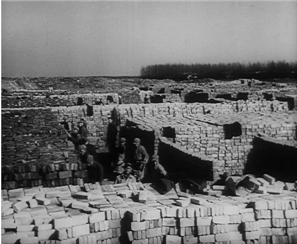
Still 7. Recycling of bricks (1940), in En toch... Rotterdam (1950).