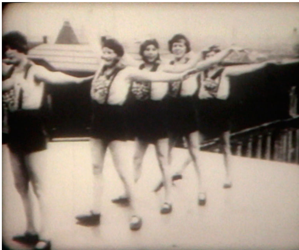
Still 9. Gymnasts on a roof at Coolsingel (anonymous, 1920s), in Rotterdamse Mijmeringen (1953).