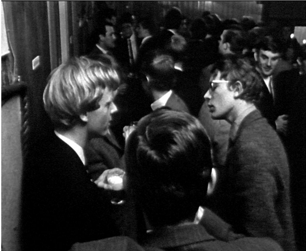
Still 12. Stad zonder hart (1966).

officials. 77 It propelled the critical discourse. Schaper subsequently worked on a sequel to his film but did not finish this project. However, the discourse had already been changed, and the city's development course would be adjusted—towards Schaper's parameters of social interaction. As such, his work, which itself moved back and forth between film and television, also oscillated between different social and spatial categories and between different times. This helped the city as a system to adjust to new conditions, not just external, but especially internal conditions.