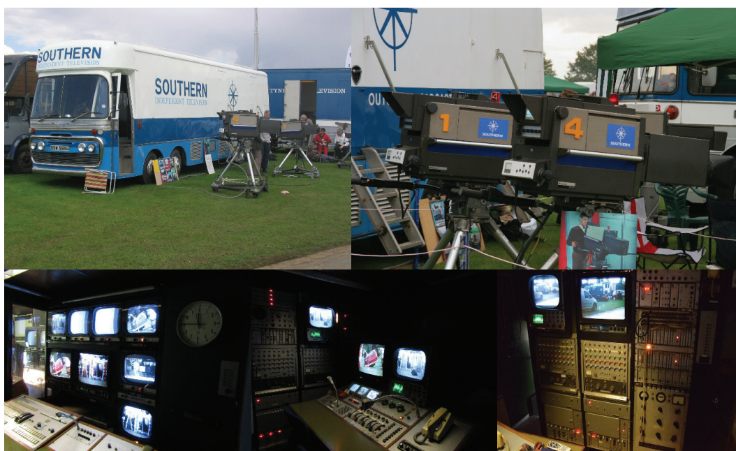
Figure 4. 'Southern Television' Outside Broadcast unit 'Big Bertha' inside and out.

Relating television technology historical narratives in written form to a narrow audience is one thing, but presenting the story with real, live hardware to the public is another. In private hands in the UK, in the specific case of the cameras described above, there are two or three EMI 2001s that can produce pictures, but they remain a long way from the broadcast standards of the day. I personally have several Marconi MkVIIIs, in good, close to broadcast quality condition installed in the oldest fully operational colour outside broadcast truck in the world-Southern ITV's rebuilt 'Big Bertha'. There are no known Philips PC60 or derivative models operational to a high standard in the UK and no data about any elsewhere, despite the model selling more than 1,800 units worldwide – three times the sales of Marconi and EMI cameras of the period added together. Residual operational camera hardware provides a window into the past, not just for media historians and engineers but for the public. However, it does have to be done with close attention to detail and best practice electronic and mechanical engineering to deliver something approaching representative results.