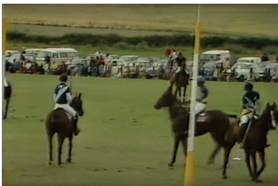
Video 4. 'Southern' in action. Polo: The Cowdray Park Gold Cup 1979 - Southern Television Outside Broadcast , Southern Television 1979, recorded by 'Big Bertha'.

gratifying is the level of interest from teenagers of both sexes and the fascination with the tactile controls (which we allow them to touch). They are a popular novelty compared to their computer keyboards and touch screens. I am always indebted to members of the volunteer team as it is certainly not something that can be taken on as an individual. Much of the above applies to the other large vehicle (as described in the 'TV-70' segment), but as a transverse layout unit it is less visitor-friendly. The same will ultimately apply to the 'new' Project Vivat unit as it is also transverse and not so amenable to visitors. The stories surrounding the British made cameras – and the colour ones in particular – are always well received and I would hope that they may be something of an inspiration towards British manufacture and to innovation.