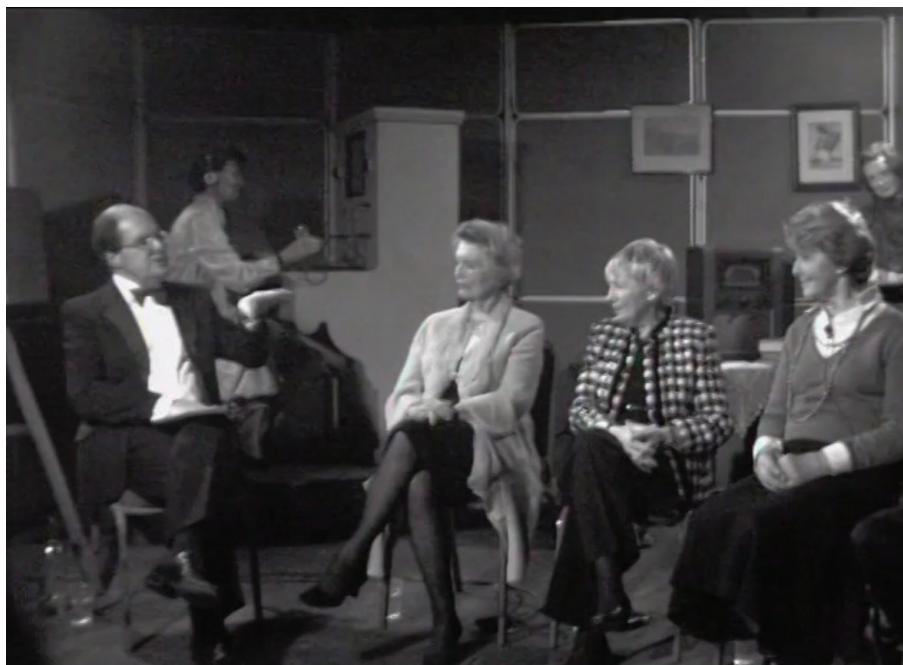
Video 1. TV70, 2006.

One of my own group's activities, Project Vivat , could also have a part to play in this for programme production. Although Project Vivat concerns the re-creation of an operational early 1950s BBC/Marconi Outside Broadcast unit which is slightly outside the period under consideration here, it is of a type that was still very much in use in the early to mid-1960s. 405-line television has a following in the UK, although it must be admitted that it is primarily amongst the older generation of engineers and technicians. However, it has become encouraging to note the enthusiasm surfacing from younger people keen to understand how to restore cathode ray tube (CRT) televisions. This is evidenced by participation in several UK based online forums, the largest of which is the UK Vintage Radio Repair and Restoration Discussion Forum . As in the world of steam power preservation, there is a new interest from younger people and BTHG 405-line transmissions will likely lift that as it develops.