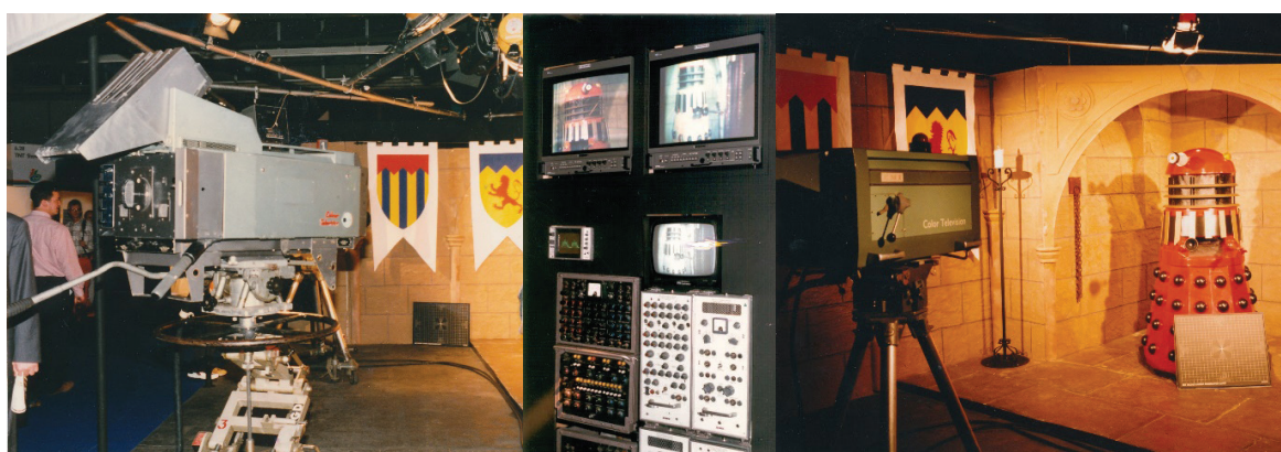
Figure 2. First generation colour TV cameras on show. Left to right: Marconi B3200 3x3" Image Orthicon 'coffin' colour camera, camera control units and picture monitors, EMI 204 3x1" vidicon colour camera. Note that the red 'Dalek' is correctly reproduced by the 'coffin' camera but not the EMI 204. This was the stand of the then National Museum of Film, Photography and Television and I had restored the 'coffin' to operational status specifically for the 1999 International Broadcasting Convention in Amsterdam.

The EMI camera was much smaller and lighter in weight, but the colourimetry was as contemporary documentation describes: dreadful. Technically, it would still be entirely possible to do this again, but there will never be the same opportunity offered by the UK Science Museum Group.