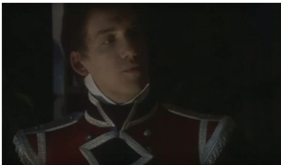
Video 3. Vanity Fair BBC Dec 2 nd 1967, first BBC drama serial shot in colour. Used Marconi MkVII cameras at BBC Television Centre in London.

The above is a narrative, which includes not just the broadcaster's perspective, but those of the manufacturers and not just of those in the UK. It also engages with the technology and the package delivers a conclusion that contributes new and different insights to existing broadcaster-centric views, especially those written by operatives such as cameramen. 16 It is but a summary, with the complex interplay of organisational politics, engineering, economics and personalities painted only superficially, but the conclusion is very different to the traditional recitals. The subsequent UK narrative in this sphere of technology into the 1970s continued to be shaped by the BBC demand for 4 tubes, when the rest of the world never really wanted colour cameras based on that design concept.