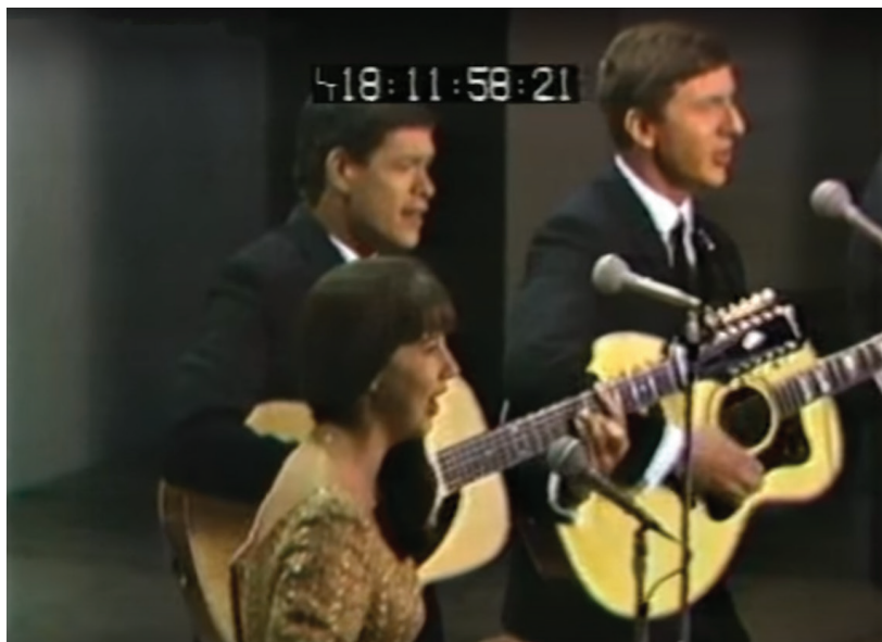
Video 2. The Seekers - Someday, One Day , March 1966. Marconi 'coffin' cameras in operation at the London Palladium. One of the cameras used was the example restored by me for the then National Museum of Photography, Film and Television. The original YouTube posting was of much higher quality than the current offering.