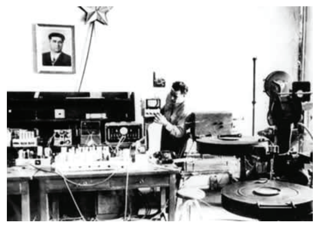
Figure 1. The birth of TV in Bulgaria.

The early history of television in Bulgaria closely resembles that of its neighbour, Romania, and could be characterised by what Mustata<sup>12</sup> calls an 'era of scarcity' where the medium lacks 'clear aesthetic, professional or institutional identity'. The first experimental work on transmitting images was initiated in 1951 by a group of enthusiasts affiliated with what is today known as the Technical University in Sofia. By May of 1953, the first over the air broadcast was