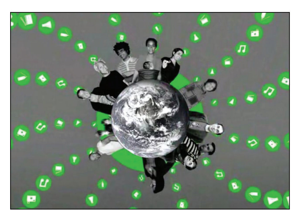
Video 3. Explanation of the principles behind the various Creative Commons licenses. Creative Commons, CC BY.