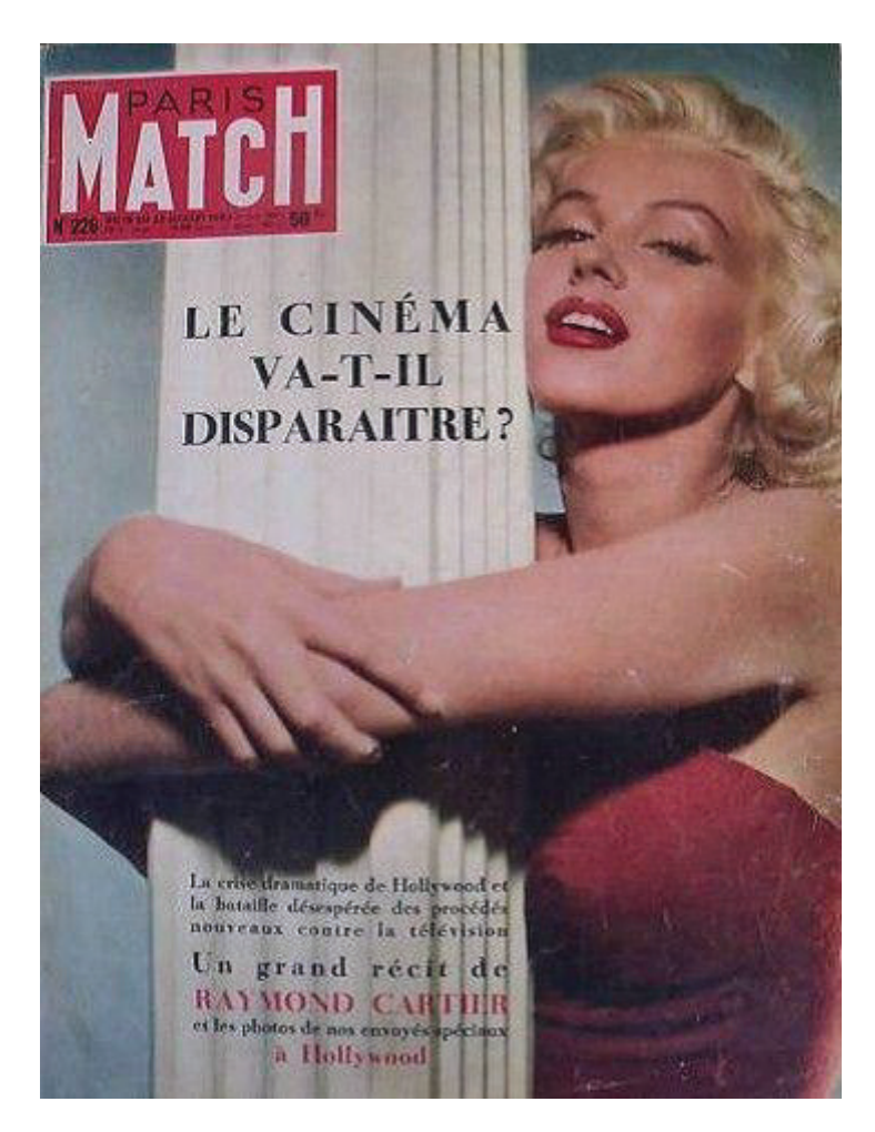
Figure 3. Cover of the popular French magazine Paris-Match, 1953: "Will cinema disappear?" The culprit: television.

media never had an end worth discussing, others have been discussed as 'about to end' for years (and proved, in most cases, remarkably resilient).