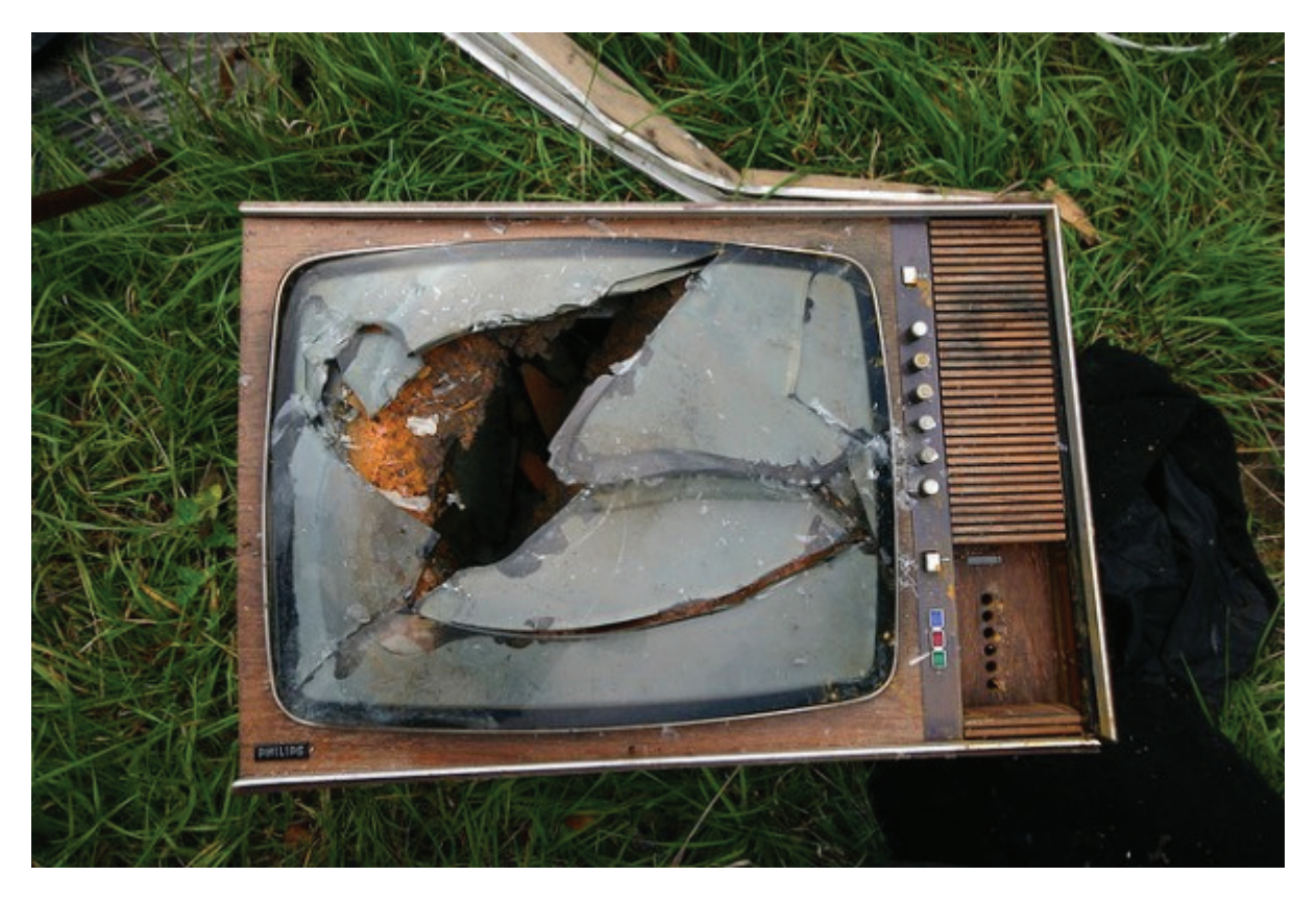
Figure 1. One of the innumerable destroyed TV sets available on Google Images.

attack on the medium, on all fronts: political, aesthetic, if not psychoanalytic, together with an indictment of a society which has begotten such a medium.