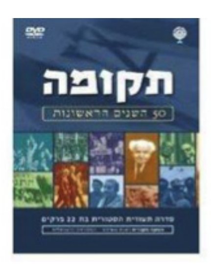
Fig. 1-2. Pillar of Fire and Revival front cover.

While Revival deals almost exclusively with events in Israel, Pillar of Fire dedicates a considerable part of its historic review to world events, particularly European. A central subject is Jewish existence in Europe. Jewish communities and way of life in Russia, Poland and Germany are described extensively, prior, during and right after the Holocaust. Major events in European history are described: the Russian 1905 and 1917 revolutions, Word War I and the Conventions that followed it, pre-Hitler Germany and his ascent to power, World War II and its major battles. Hundreds of film excerpts, the result of unprecedented, meticulous research projects in European archives, depict life in Europe in the last quarter of the 19<sup>th</sup> century and the first half of the 20<sup>th</sup>.