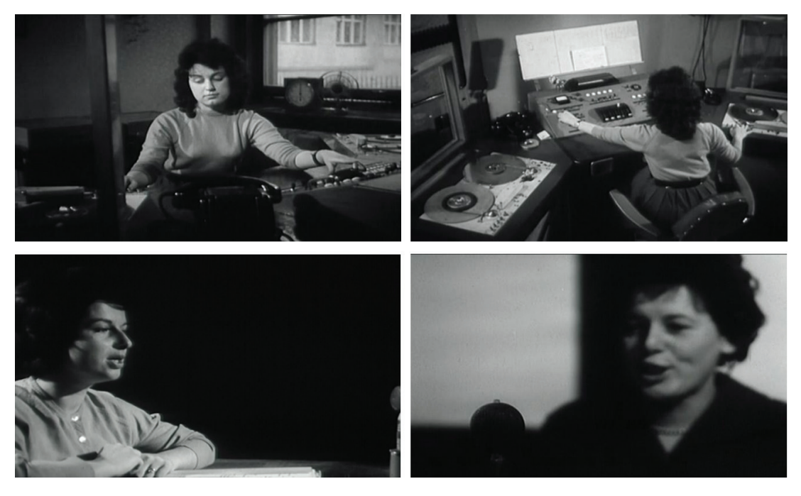
Figure 1a-f. Continued

We can extend the above analysis to self-reflective practices of television and radio professionals in relation to their own production practices, including production and contextual documentation, via audiovisual and written texts and activities (internal, semi-internal and publicly accessible), such as internal reports.<sup>23</sup> Sometimes such internal reports were also 'visualized' in discussions on television as they related to larger discussions in society, specifically on the role and representation of women in/on radio and television, and in jobs at these institutions. In an RTÉ Late Show special looking at the representation and portrayal of women in the media from 1980, a panel and the studio audience discuss how women are represented and portrayed in and on Irish radio and television. A report submitted to the RTÉ Authority by a committee led by Senator Gemma Hussey is the starting point for the discussion. Introductory remarks from the report are read out aloud on television: