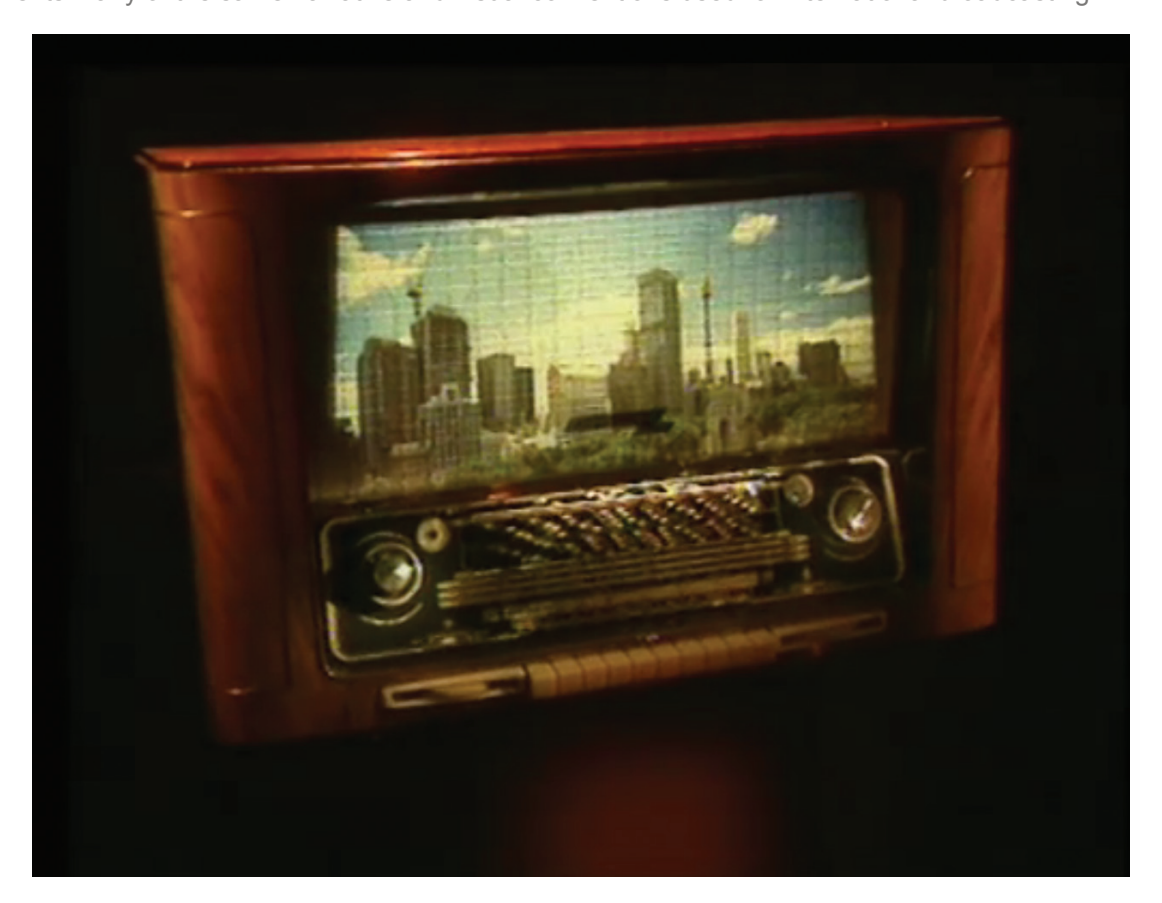
Video 8. 5 years DW-TV, Deutsche Welle 1997. Go to the online version of this article to watch the video.

Finally, a clip celebrating the 5th anniversary Deutsche Welle TV offers us in visual imagery a review of the beginnings of DW-TV, after taking over RIAS-TV (Rundfunk im amerikanischen Sektor, Broadcasting in the American Sector). Deutsche Welle-TV has been on air since April 1st 1992. Its opening makes the transition clear: focussing on a classic-model radio, in which 'television' pictures begin to appear – converting it visually into a TV set. From there, the scenes that make up its first minute take up a familiar pattern: the grand opening of the new institution; a tracking shot in through a building to show broadcasters at work; this is then followed by shots that emphasize the technology. Here the transmitter antennas are replaced by rockets, as satellites and their footprints represent the global reach. The montage of languages is seen but not heard in an infographic. While focussing on television, this clip, too, follows and documents many of the same narrative and visual conventions used for international broadcasting.