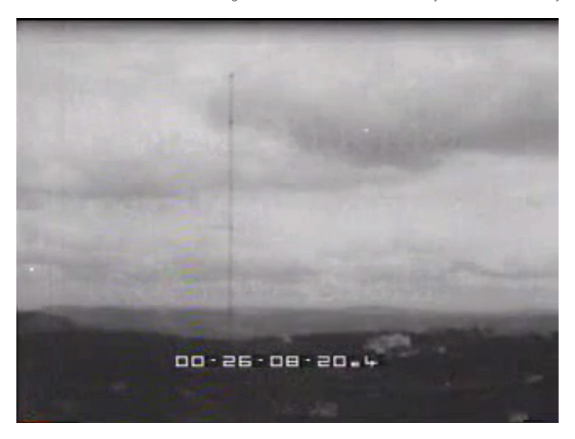
Video 7. Implementing and developing radio in Sicily, LUCE 1951. Go to the online version of this article to watch the video.

The visuals are at best vague about the geographical reach and intent of the radio station. In fact, the antenna ultimately served not only its immediate region, but also reached much of the Mediterranean, including Spain and North Africa. To a certain extent it was a kind of counter-pole to the long-established international transmitter in the Adriatic port of Bari, famous since the 1930s for its Arabic broadcasts<sup>36</sup> – and shown briefly in this 1962 newsreel ('03:16-'03:29) with tell-tale static sounds, also as a site of the radio receiver industry. In spite of this potential importance outside of national territory, the newsreel itself highlights for a domestic audience the new transmitter's role in shoring up radio's territorial function, saying it will 'solve the radio problems of Sicily and large parts of Calabria'. Comparing this video with the other clips on international broadcasting that feature montages of voices and languages also underlines the extent to which the clip actually silences the 'voice' of the station. Following a montage of scenes building up to a view of speakers in the studio, the clip stops just before they begin to speak, and thus avoids the politics of accent and dialect in claiming the airwaves over Southern Italy as national territory.