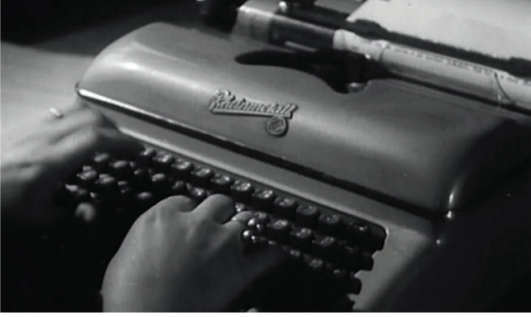
Figure 1a-f. Different technical and creative professions performed by women in a 1961 Czechoslovakian radio studio.<sup>22</sup>