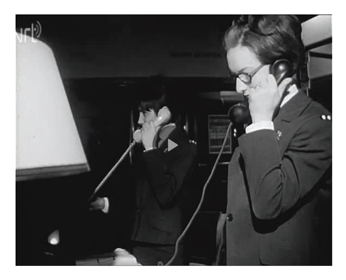
Video 2. Public Broadcast, VRT 1966. Go to the online version of this article to watch the video.

Openbare Omroep (Public Broadcast) (1966) which presents the Belgian VRT's public broadcasting building at the Place Flagey square in Brussels, is a more straightforward 'behind the scenes' documentary, showcasing the generic bustle of an office space over the technical power and know-how of the station. People pushing telephones and paper dominate, with roles between men and women much less visually defined. The moment of focus on technology features a montage of recording technologies ('01:36-'02:02), and while the voiceover suggests this is strongly technical work ('How many technicians spin the records?') the technologies do not look considerably different from that of home technologies — particularly the gramophone record, but also the '¼' tape - plus the operators themselves are barely shown. Indeed, only when the documentary turns to television (circa '02:05), do broad banks of technical equipment become strongly foregrounded - and among the technicians a woman is clearly visible ('03:27). Curiously, about the most consistently gendered technology on display throughout is the typewriter, which is only shown being operated by women.