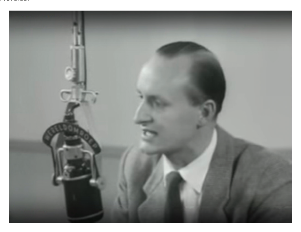
Video 6. Broadcast for 10th anniversary of the Dutch 'Wereldomroep', Radio Netherlands Worldwide. Go to the online version of this article to watch the video.

languages. Comparing the two newsreels also highlights a strong contrast with the Czechoslovakian film reel: namely the relative absence of high technology in the latter: no transmitters underline the strength of the signal, no engineers turning unidentifiable knobs in transmission control rooms suggest technological prowess, no banks of reel-to-reel tape players accent the vast content or production of the station. As such, the clip actually erases most elements that could be seen as competition in the airwaves with the West. Instead, the clip highlights other elements: global connection and cosmopolitan competence. The emphasis comes to lie on the vast amount of correspondence, complete with folkloristic 'souvenirs' from other nations. The montage of announcements in foreign languages also creates a view of a country that is open to the world, but at the same time, staying in place. the clip's closing shots, not of the world, but of antennas on the roof overlooking Prague seem not so much to present international broadcasting as reaching out, but as bringing in other countries - as a kind of tourism in reverse.