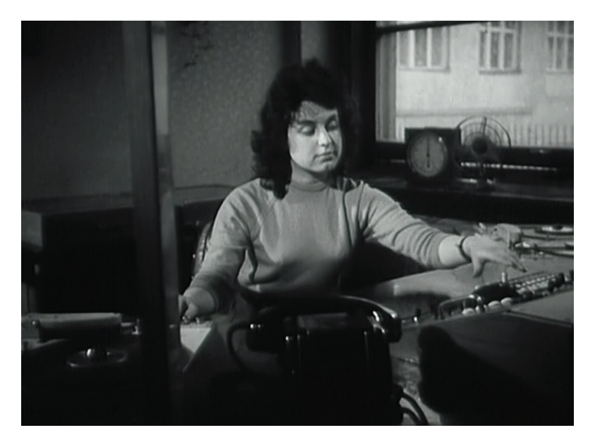
Video 3. The Czechoslovak Newsreel 25, CT 1961. Go to the online version of this article to watch the video.

creative practices carried out by both men and women in a more or less equal manner, such as technical practices, reading letters, the creative practice of speaking to listeners in a radio studio, and research. This department for the international broadcast of the Czechoslovak Radio at this time broadcasted 30 hours a day in twelve languages, with a large listener response: every year about 50 thousand letters were delivered from all over the world.