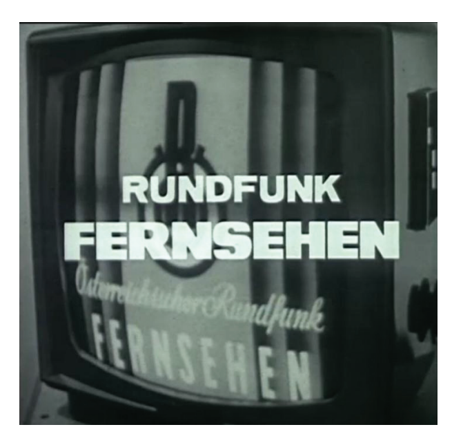
Figure 2. The original title Rundfunk Fernsehen is echoed in the picture on the television screen 'Österreichischer Rundfunk: Fernsehen' 27

In an Austrian clip for school television titled 'Radio-Television' (1966) presenting a history of television, radio appears as mostly a step towards television. The English title, which created the search hit, seems to be something of a mistranslation: the original German title Rundfunk-Fernsehen would perhaps have been better rendered as 'television broadcasting'. But to an extent, this mistranslation captures the uncertainty around the two terms, and points to the genealogical imagination of television as radio with pictures, captured also in Dutch in the term beeldradio ('image radio') and in the German word Bildfunk which was used during the development phases of television. In the opening sequence of the clip ('00:50-'01:05), television 'quotes' itself with a close-up on a television set. The title 'Rundfunk Fernsehen' (Figure 2) is echoed in the picture on the television screen ('Österreichischer Rundfunk: Fernsehen') and the voiceover announcement from the television set ('This is the Österreichischer Rundfunk with its television programme'). This a subtle shift of meaning from the programme's title: Rundfunk here marks the name of the institution, and Fernsehen specifies the medium itself. Thus, while the title of the programme seems to sketch a general development of a technology, it is immediately ideologically bound up with the national institution.