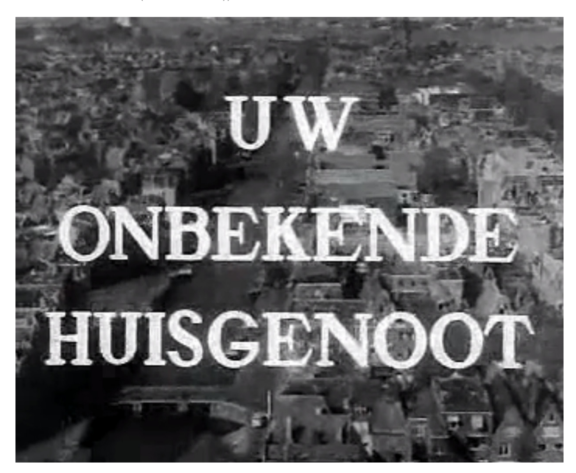
Video 1. Your Unknown Housemate, KRO 1954. Go to the online version of this article to watch the video.

points (usually in ensembles), as well a telephone operator ('06:17), the host of children's programme ('06:42), the co-host of a record request programme ('09:12) a piano player ('10:20), maker of school programmes ('16:18), voice actress in a drama written by a woman writer ( Nodeloos Avontuur ('Needless Adventure') by Hélène Swildens, broadcast December 18th 1951, ('23:34-'25:50)).