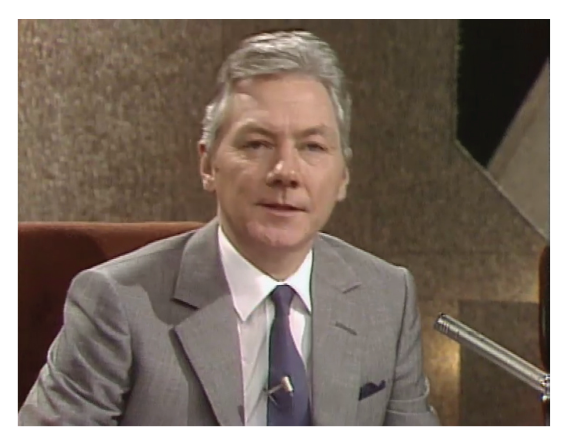
Video 4. Women in the Media, RTÉ 1980. Go to the online version of this article to watch the video.

Whilst for instance news programming and film reels would often foreground prominent male radio personalities and figure heads ,<sup>24</sup> the visualization of such 'behind the scenes' activities and related concerns and considerations gives further insight into the ' hidden professions ' and gendered labour division related to radio's production practices. Here, the real 'work' of what is meant to sound effortless, is made visible.