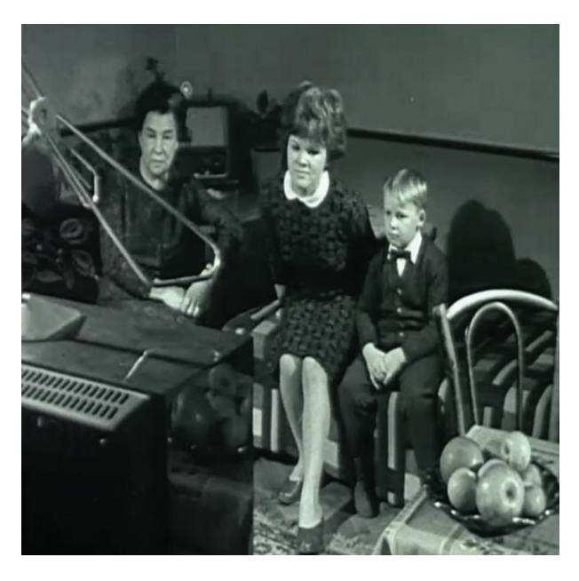
Figure 3. Television's-eye view of a small living room.<sup>29</sup>

Eastern Europe, this was a key aspect of broadcasting that took on new importance in the Cold War era.<sup>30</sup> Not surprisingly, either, most traces of the most famous Cold War radio Radio Free Europe in the former Soviet bloc are from 1991 after the collapse of the communist regimes, with the exception of a mention of the station as a harmful influence in a Czechoslovak news segment on protests in October 1989 . Beyond the Cold War, shortwave broadcasting took on a new and multi-layered importance, embraced by UNESCO among others as a peaceful means of international understanding and global development,<sup>31</sup> not to mention continuing for many countries, including Britain, France and the Netherlands, a complicated connection to (former) colonial holdings.<sup>32</sup> As Komska argues, overseas broadcasters relied in particular on visualizations . Not necessarily for their own audiences, but for the 'home' audiences for whom their voices (supposedly speaking for the nation) were not familiar – or, in the case of foreign languages services, even intelligible.<sup>33</sup>