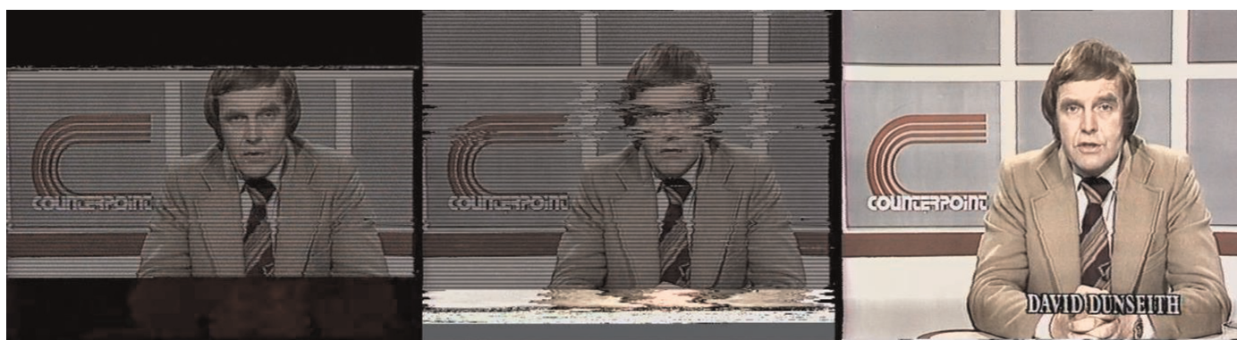
Fig. 2 Media archaeography in action: 'Violent Death On The Border' (23/11/1980) emerges from the static at the end of a drinks commercial..

Surviving material from UTV's domestic videotape library provided easily accessible viewing copies of the station's programmes for internal purposes from 1970 onwards. Due to their nature, these tapes were recycled on an ad-hoc basis and were never subject to the degaussing procedures used for erasing the station's master programme recordings. As such, tapes seem to have been selected for recycling on a random basis after use, which sometimes led to significant mismatches between recordings and actual tape length. This mismatch resulted in the preservation of otherwise lost material. The most extreme example located during the Counterpoint project concerned a previously lost edition, 'Violent Death On The Border' (27/11/1980), which was found on a U-Matic tape labelled as holding a drink commercial from the late-1980s. The commercial actually occupied just thirty seconds of a 60 minute tape, meaning that the entire Counterpoint programme survived with the exception of its opening titles.