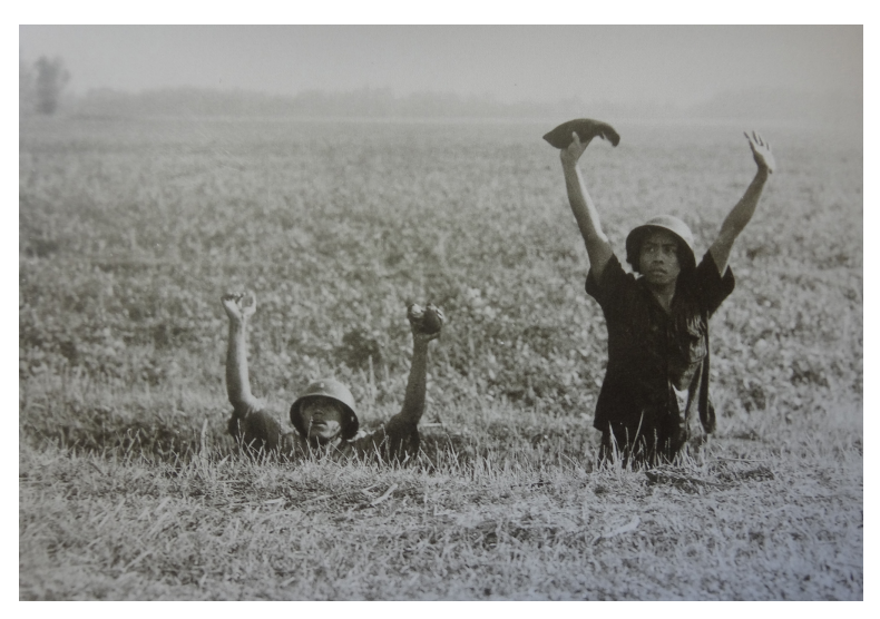
Photo 10. Indonesians arrested, photographer: H. Wilmar. ©Nederlands Instituut voor Militaire Historie (NIMH)

28 Indonesia Merdeka, Netherlands Institute for Sound and Vision, Taak ID 31281.