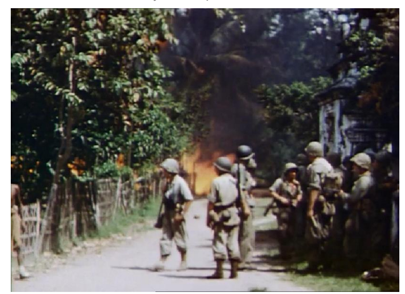
Photo 12. Brigadeflitsen , footage shot in 1946 by the Marine Information Service. Go to the online version of this article to see the full video.