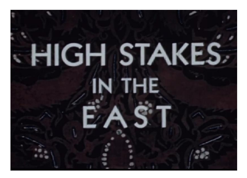
Photo 2. Title sequence from High Stakes in the East, 1942. Go to the online version of this article to see the full video.

got an Oscar nomination, and Peoples of the Indies . These were so-called short films, each lasting ten minutes, with a voice-over that was clearly aimed at American audiences.<sup>15</sup>