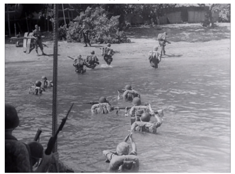
Photo 11. The landing of the marines at Pasir Putih, part of a longer movie newsreel about the Dutch military operation in the summer of 1947. Go to the online version of this article to see the full video.

It is telling that De excessen van Rawagedeh , the documentary that had far-reaching consequences for the policy of the Netherlands regarding war crimes in Indonesia, did not use archival footage. Even with re-editing the original government films, it is hard to convince today's audiences that this colonial war was one of guerrilla warfare and atrocities. The message that the films once were meant to give, lingers on. This becomes clear as one reflects on one of the more 'popular' sequences from these days: the landing of the marines at Pasir Putih, a stronghold on the coast of East Java, at the start of the military push in the summer of 1947.<sup>34</sup> The sequence originates from a long Polygoon report on this offensive and is often used in television programmes, as the start of a historical overview of what happened ( Achter het Nieuws also started with these shots).