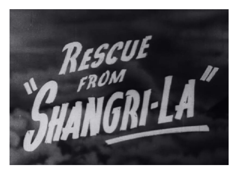
Photo 3. Title sequence from Rescue from Shangri-La , a film by the Dutch Government Film Service in Australia about a spectacular rescue of Americans in the interior of Dutch New Guinea. Go to the online version of this article to see the full video.

archipelago. Van Mook was at first willing to cooperate with the nationalists, but the Dutch government blew the whistle on him. It took the Dutch authorities four years to realize that the Dutch East Indies had essentially ceased to exist, four years in which a huge amount of films were produced to defend the Dutch position, that the colony could