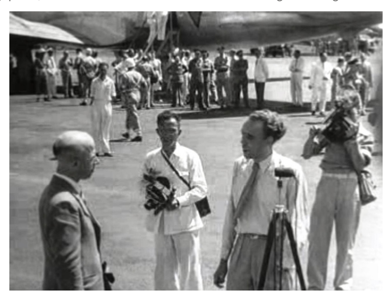
Photo 6. The arrival of Dutch PM Louis Beel at the airport Kemajoran in Batavia, where he is welcomed with the question: "Did you have a good trip, your excellency?" Go to the online version of this article to see the full video.

After the war, the government of the Dutch East Indies was the owner of all Dutch language media in Indonesia and people were well aware that this did not suit a democracy. In a policy document from 1946, this situation was described and condemned as inappropriate, but it also provided an explanation: because the war had destroyed all Dutch language media, the help of the government was needed to restore a proper media environment. And since rebuilding needed a 'new spirit,' it was deemed necessary that there would be, for the time being, a certain amount of government control over the media.<sup>21</sup> This 'for the time being' lasted until the moment of the transfer of sovereignty at the end of 1949. The minister of Finance regularly pushed for selling the film studio, as the cost of film production was very high and films never made any profit, but this was never realized. Lieutenant governor-general Van Mook prevented it,