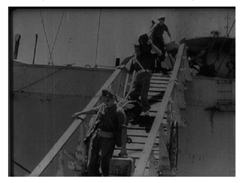
Photo 7. Linggadjati in de branding, a documentary explaining the military actions of the Dutch in Indonesia, 1947. Go to the online version of this article to watch part 1 of the documentary.

With the transfer of sovereignty in 1949, the future of the films produced by the Gouvernements Filmbedrijf Multifilm Batavia was uncertain. Several fires in the film studios in Jakarta in the beginning of the fifties destroyed much of the original footage, but copies of the edited films and newsreels were kept by Multifilm Haarlem, the parent company of Multifilm Batavia. In 1953, the Indonesian government asked Multifilm Haarlem for these copies, which they considered to be part of the cultural heritage of Indonesia. Multifilm was willing to ship the films but also asked for the support of the Dutch ministry of Foreign Affairs to finance copying and preserving these films as part of the Dutch cultural heritage. After some haggling, about 40% of the films were copied and stored in the vaults of the Dutch Government Information Service (RVD) near The Hague. The collection became once more complete when, at the beginning of the eighties, the Indonesian government asked for help with the conservation of the films in their possession. They were shipped back to