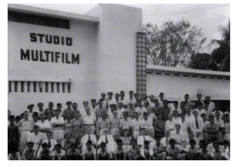
Photo 5. Studio Multifilm Batavia, ©Dutch Government Information Service.

The films produced during the years 1946–1949 come in a variety of forms, but for this paper the main focus is on the longer documentaries and newsreels. To start with the latter: in the Netherlands, Polygoon was the main and in fact only Dutch newsreel after the war, distributed in 110 copies every week around the country. News from Indonesia was a regular feature in Polygoon , but they did not have their own office in the colony. All their footage came from the Gouvernements Filmbedrijf. Polygoon took pride in being an independent company that used different news sources to make a story, but when it came to Indonesia, the sources were limited to one: the government. More film