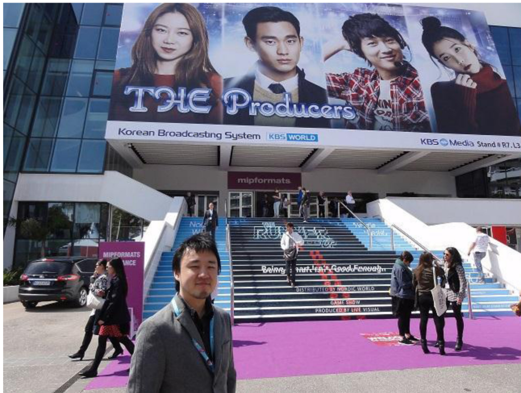
Figure 2. The author at the MIP TV 2014.