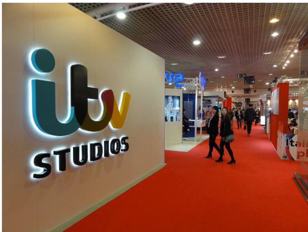
Figure 3. Big booths and stands.