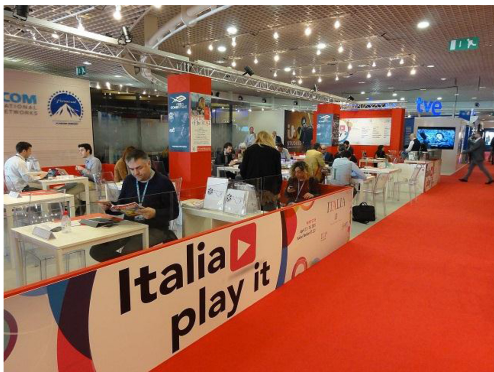
Figure 5. Small conversations in every corner.