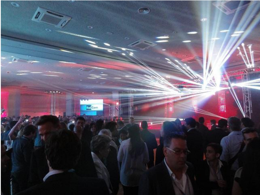
Figure 4. Welcome party at MIP TV 2014.