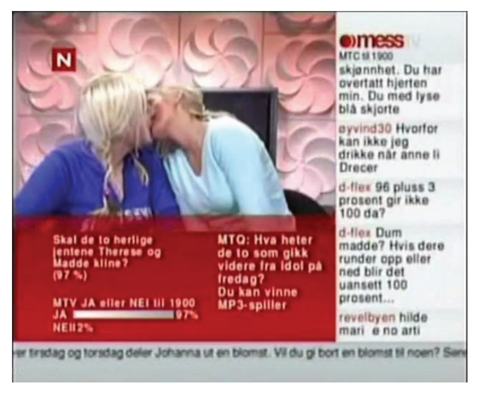
Figure 2. Mess-TV.

The picture below (picture 2) show how audiences participated, both in terms of votes and of SMS engagement. In the red horizontal line, viewers were asked to vote on whether the two hosts should make out, while in the white vertical line, they were asked to send an SMS with greetings or comments to the host or the show.