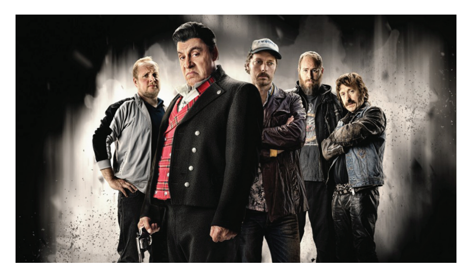
Figure 3. Lilyhammer.