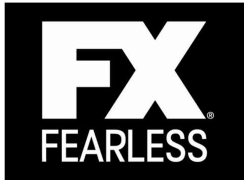
Figure 3. FX Network logo (2013).

As a result, among television creative talent, FX became the first stop for those “looking to make shows for the smart set.” 26 Furthermore, as of 2012, the network had garnered more Emmy and Golden Globe award nominations and wins in acting categories than any other basic cable network. 27