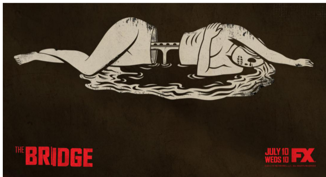
Figure 4. Promotional art for The Bridge (season one). Click here to see the source.

As FX was in the process of ordering The Bridge to series in early 2013, Landgraf positioned the show as meeting some of the channel's long-standing needs. At the Television Critics Association (TCA) winter press tour, he claimed to be "getting a little tired of male anti-heroes" and expressed hope that Kruger and Keri Russell, the female lead in the network's Cold War spy drama The Americans (FX, 2013-), would attract female viewers. 33 Speaking more generally about the traditionally masculine appeal of FX, he said, "From the earliest time that I had the opportunity to start making decisions about what we would put on the air, I have felt really strongly that I don't think FX should be a male or a female brand. I think it should be a brand, like HBO or Showtime, that appeals to both." 34