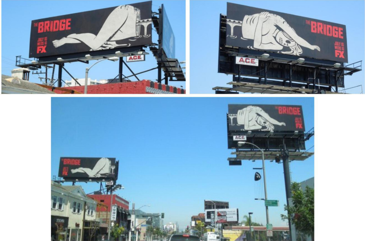
Figure 5. Outdoor marketing campaign for The Bridge in Los Angeles

In several markets, FX promoted The Bridge with a visually aggressive outdoor marketing campaign. In addition, FX held mural contests in predominantly Latino neighborhoods in New York, Los Angeles, Miami, Houston and Chicago. 38 Artists were asked to contribute submissions that would “reflect the collaboration and connection of Latino and American cultures and contest winners were announced the weekend before the July 10 th premiere.” 39