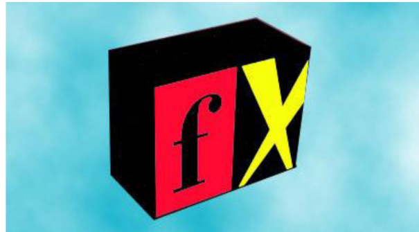
Figure 1. FX Network logo (1994). Click here to see the source.

radio personality Howard Stern attached as an executive producer. Although these efforts succeeded in attracting a niche audience of men, FX still lacked a cohesive brand identity.