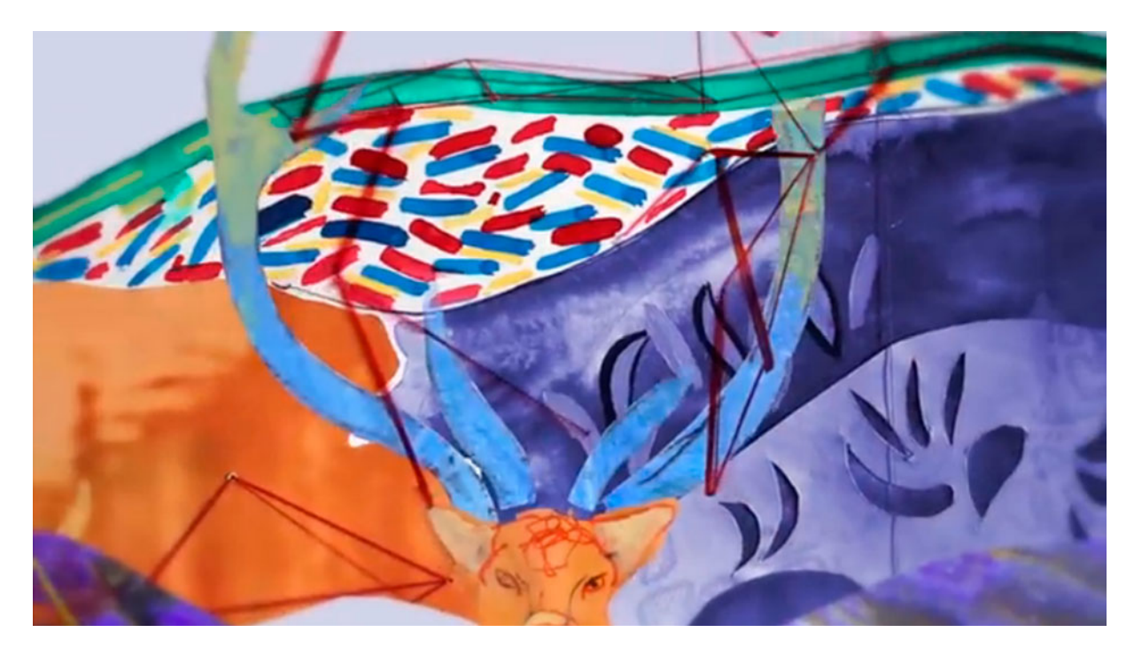
Video 2. Keying into the Brain. Click here to watch the festival leader

produced about 80 video's a year for large companies such as a national bank (Nederlandse Middenstands Bank, NMB) and Toyota Netherlands. At the time it offered production services as well as facilities like a studio, duplication and (post)production. The facilities and production were separated in two companies, and Talmon chose to run the production company. In the 90s the focus changed from video to digital, as Total Video was renamed into 'Talmon AV producties' in 1997 and later into 'Talmon Online Storytelling.'