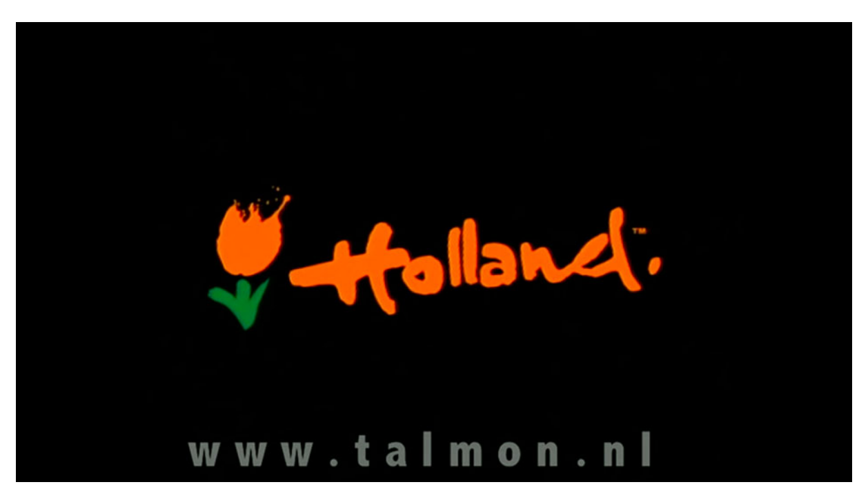
Video 3. Say Cheese! A Journey through Holland by Talmon TV. Click here to watch it