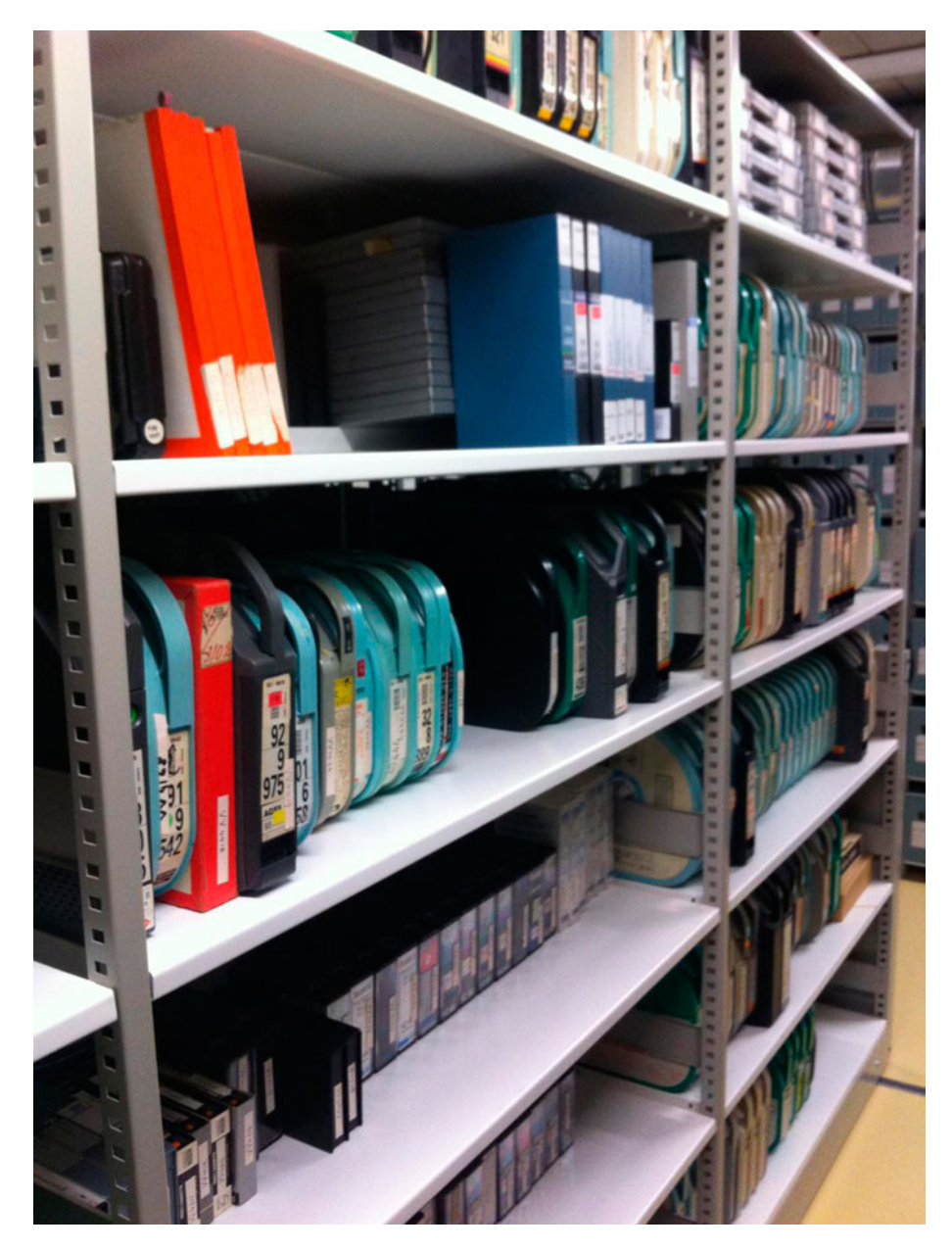
Fig. 3 A variety of video formats in the vaults of Sound and Vision