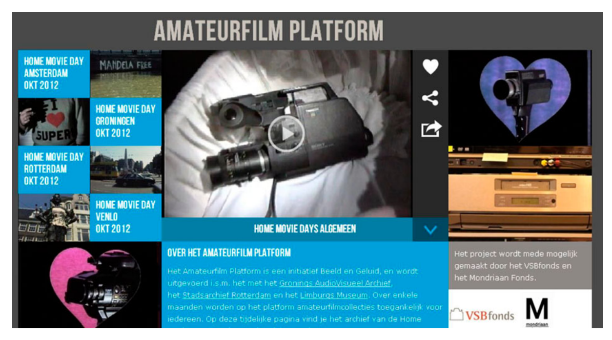
Fig. 1 Screenshot Amauteurfilmplatform

Commissioned productions can be considered ephemeral media forms. Paul Grainge describes the ephemeral as signifying a relation to time (duration, shortness, speed) and regimes of transmission (circulation, storage, value).<sup>1</sup>