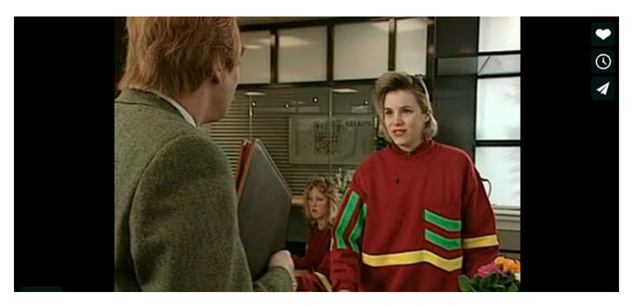
Video 1. Intratuin Momentje AUB. Click here to watch it

audiovisual archives such as Sound and Vision. To study changes in the production and distribution of audiovisual media, documents as well as the productions themselves are essential.